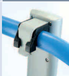
Hand control rest