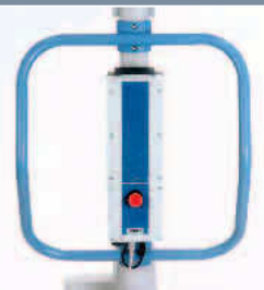
Ergonomic oversized push handle