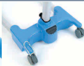
Ergonomic foot push pad