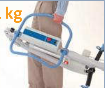
Mast and boom

In addition to outstanding performance, the Advance can also be folded, or separated for onward transportation.