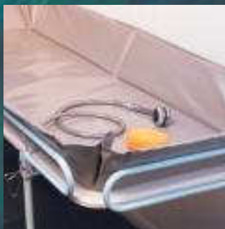
T13 Shower/Changing unit Fold away wall mounted model