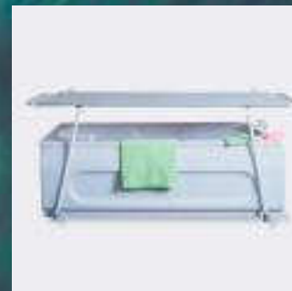
T11 Shower/Changing Stretcher

The Shower Trolley range allows a patient to be transferred to the bathing area, showered, dried and clothed, minimising the need to lift manually and in line with current Moving and Handling Regulations.