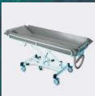
T1 Shower Trolley

The Shower/Changing Stretcher allows patients to be washed over a bath or in a shower area, in the prone or raised position. For ease of storage the stretcher folds flat against the wall when not in use.