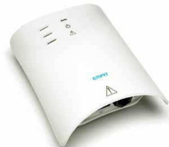
Emfit Movement Monitor D-2090

The Emfit Movement Monitor operates with 2 pcs 1.5 V AA size alkaline batteries. Optionally a medical grade AC adapter is available.