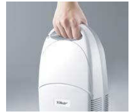
Convenient built-in Handgrip