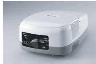
Hidden Storage for Electrical Cord