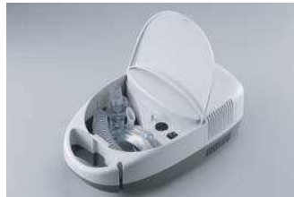
Large Storage Compartment